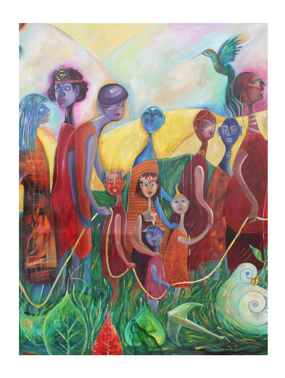
LEAVE NO-ONE BEHIND