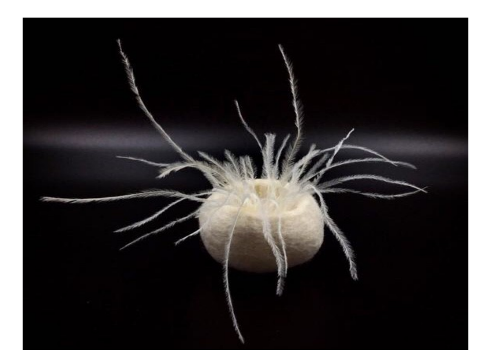
Form (4) cilia

The topic of this research is the innovative idea of the living organisms . with wings , mustaches and cilia affected by movements and air