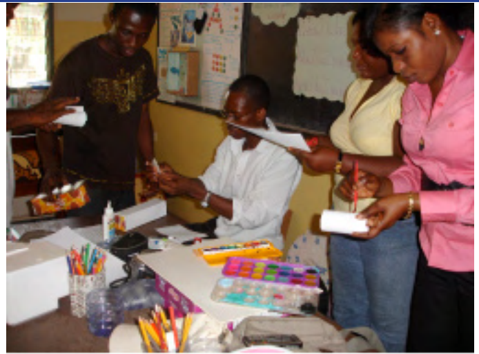
Figure 1. KNUST masters students making TLMs at AWTC.

There is an obvious gap between the schools, training colleges, and universities in terms of goals, philosophy, accountability, and practice. At KUNST, the Art Department offers masters and doctorate degrees. Because school teachers are trained at teacher training colleges 1 and not at our institution, we have had little influence over how or what they are learning. Many of our students, however, are instructors at the teacher training colleges and come to us for advanced degrees. We realized the opportunity we had to train the trainers in alternative strategies that may make a difference at several levels of education. Hence, a pilot program was developed with objectives dealing with instructional media, class size,