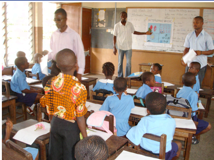
Figure 2. KNUST masters students teaching first graders using TLMs