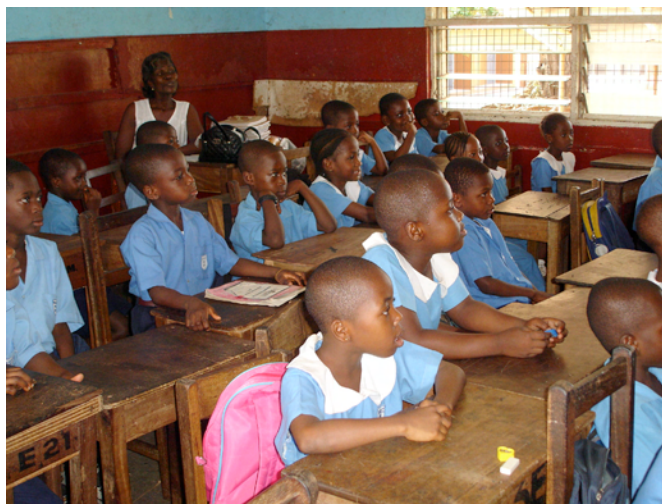
First grade class and teacher watching TLM lesson

At the high school level students are organized into disciplinary tracks based on choice and aggregate junior high school grades. Placement is competitive and it is very common for students to be placed in the Visual Arts track because their aggregate do not qualify them for their first choice, typically science or business. A similar pattern happens when students enter university: students applying for the more popular majors such as the sciences or technology may be placed in the agriculture or art departments. These occur-