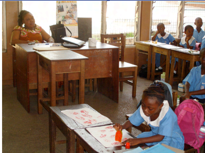
Figure 3. First grade teacher watching TLM lesson

AWTC visited our campus, art gallery, and the primary school, bringing the project full circle. The pilot project was a huge success and got rave reviews from all concerned parties.