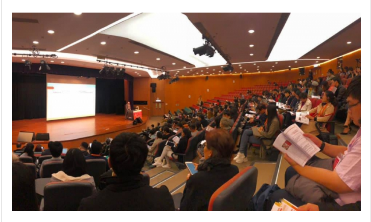
8-12 December 2018: The InSEA Asia Regional Congress, 2018 was hold in collaboration with the 7th World Chinese Art Education Symposium in Hong Kong . It was a great event with many participants from China and other countries of Asia and other continents. During the event , the creators of the Asia Regional Council of InSEA met to discuss the Regional Board next steps and future plans for InSEA in the region: Bangkok will probably be the venue for the next InSEA Asia Regional Congress in 2020.

course appreciate the impressive artistic scenario of South Asian artists represented in the art biennial of Bangkok.