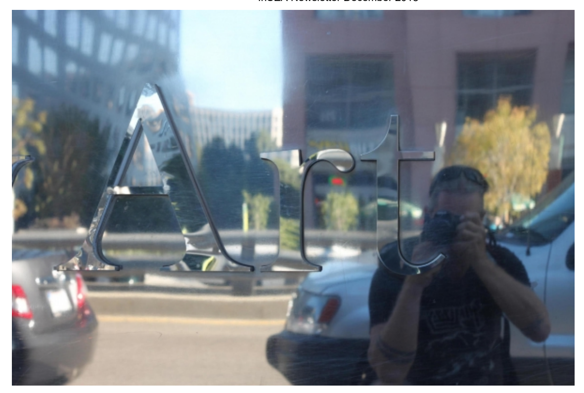
IMAG # 8- Call for Submissions